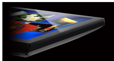
Flat Front Surface (Virtual Bezel)