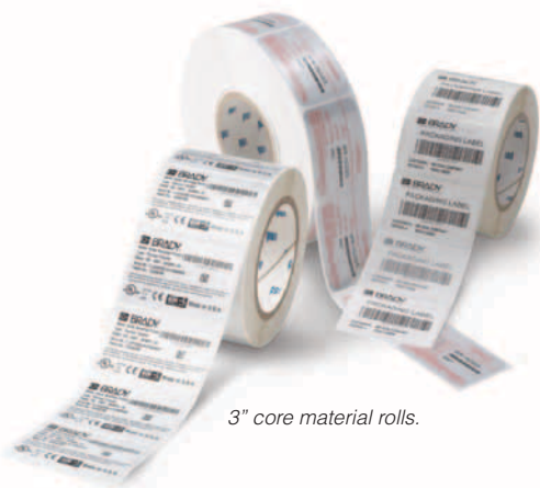
3" core material rolls.