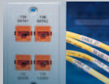
Voice & Data Communication