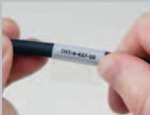
Wire & Cable Adhesive Labels