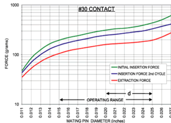
The insertion/extraction/normal force characteristics above were derived using a 30 microinch gold plated contact and polished steel gauge pins having a bullet-shaped tip. The curves represent typical average values. The charts only guide you in selecting a clip that is close to your specification. Your results may vary, so for your specification, we encourage you to obtain complimentary samples for your evaluation.

*International Annealed Copper Standard, i.e. as a % of pure copper.