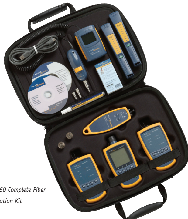
FKT1450 Complete Fiber Verification Kit