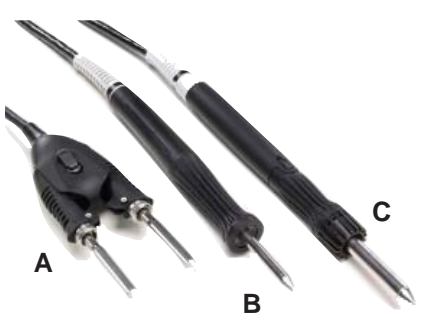
MFR-2200 Series Hand-pieces A. MFR-H4-TW Precision Tweezers B. MFR-H2-ST Soldering Tip C. MFR-H1-SC Soldering Cartridge