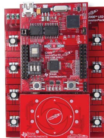
▲ Expand your C2000 Piccolo LaunchPad with application-focused C2000 BoosterPacks, which plug right into the headers. Pictured: C2000 Piccolo LaunchPad plus C2000 LED BoosterPack plus MSP430™ Capacitive Touch BoosterPack