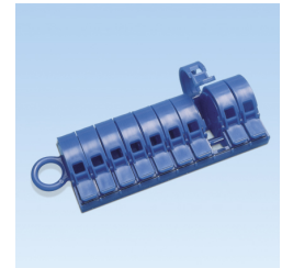
PM D EMPTY DISPENSER